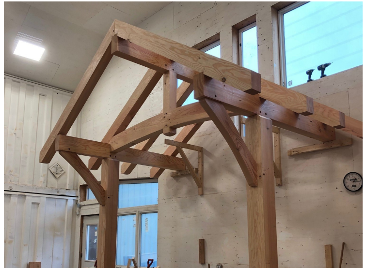
Entry Side Timber Frame—in Tamlin Factory