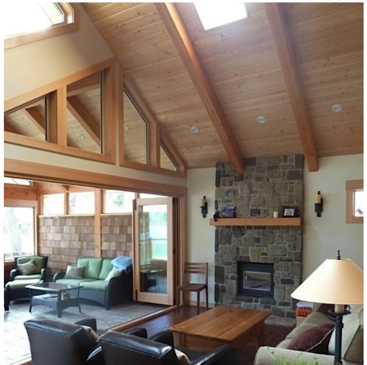
Living Area to Sunroom (for reference only—shows interior options)