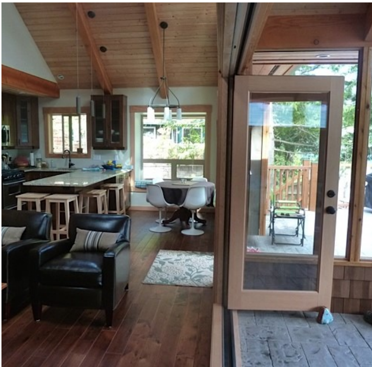
To Living/Kitchen from Sunroom (for reference only—shows interior options)