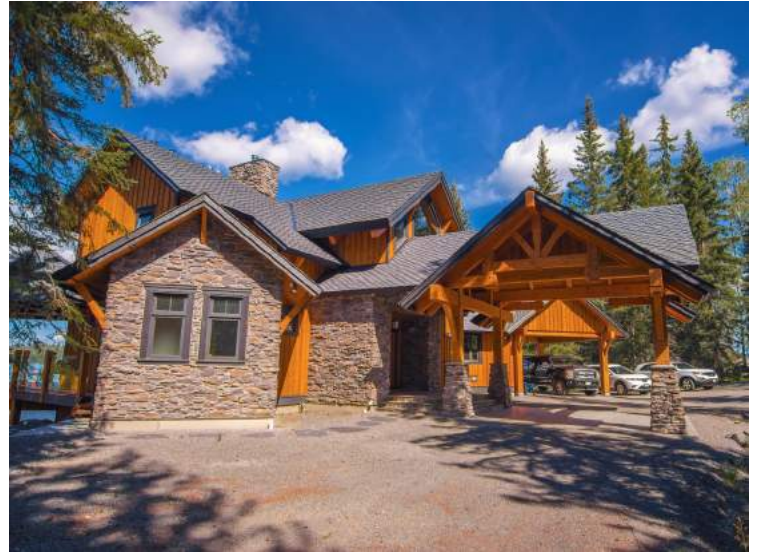
Exterior View 2