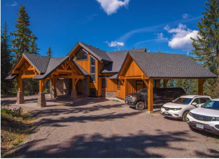
Exterior View 1